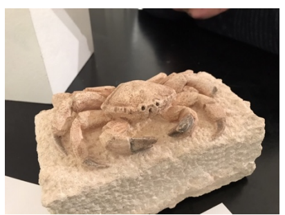
2020 Catalogue and Images from 2019 Exhibition

The Third Annual Exhibition will take place at Gallery Different from 15<sup>th</sup> – 20<sup>th</sup> November 2021